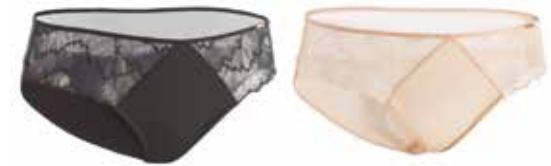
Lace Mini Bikini