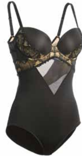
Lace Smoothing Body