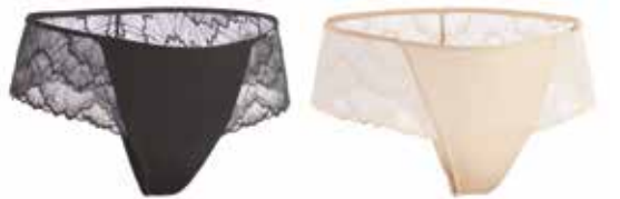
Lace Low Thong