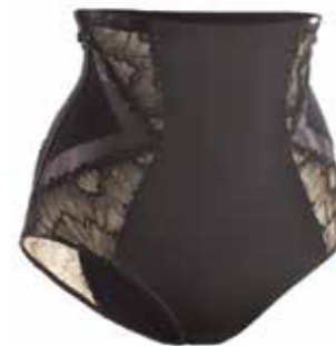
Lace Control Brief