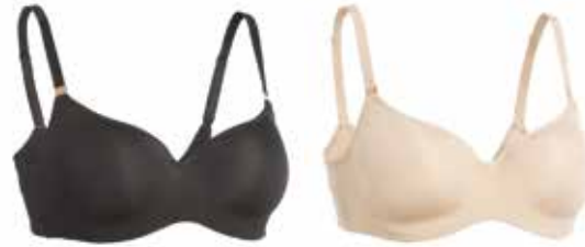
Everyday Smoothing Bra

32-40B / 32-42C / 32-42D / 32-42E / 34-40F