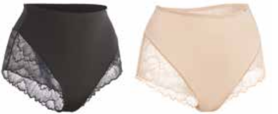
Smoothing Lace Brief - Best Friend

36-40B / 34-42C / 34-42D / 34-42E / 34-40 F