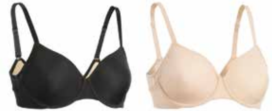
Lace Unlined Mould Bra