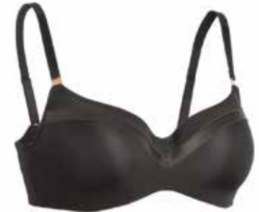
Micro Satin Bra