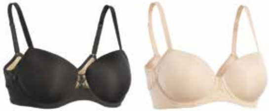
Lace Everyday Bra

So if like us you've had enough of uncomfortable wires and you're looking for an all day... comfort, luxe bra that makes you feel and look amazing you've found your No.1 bra.