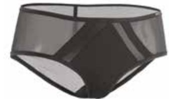
Micro Satin Short